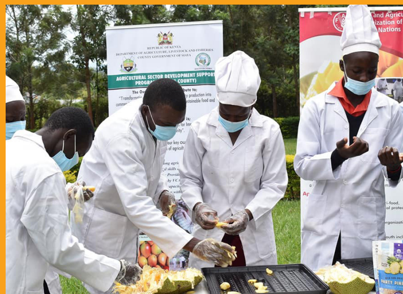
People living with disability drawn from across the County being trained on dry fruit processing at Summit Hotel

He further stressed the need of all sectors to prioritize budget and decision making geared towards empowering such special men and women in the society.