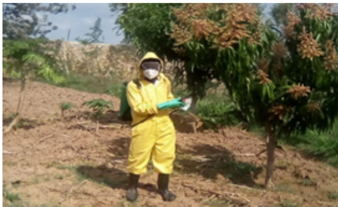
Mango Sprayer Service Provider at work spraying mango orchards against pests and diseases

Increasing productivity in mango value chain has highly been contributed by spraying service providers within the county. Majority of mango seedling practitioners and producers in the past have experienced an increase in various pests and diseases thereby leading to low production which resulted to low volumes of mango and mango products traded within the various markets in the county and beyond.