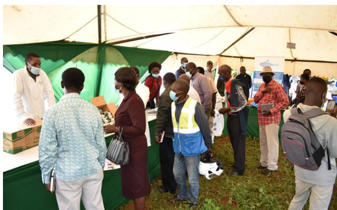
Department of Agriculture, Food Security, Livestock and Fisheries, County Government of Siaya

Mr. Bolo also appealed for women and Youth to fill the value addition gaps because the opportunities are overwhelming.