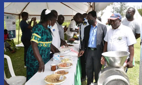
Mr. Bolo County Director of Fisheries visiting Exhibitors' stands during a Cassava field day in South Gem, Gem Sub – County

T he County Government of Siaya in Partnership with Ugunja Community Resource Centre (UCRC) has today conducted a Cassava field day in South Gem, Gem Sub – County as a way of promoting the crop's adoption for increased food and incomes.