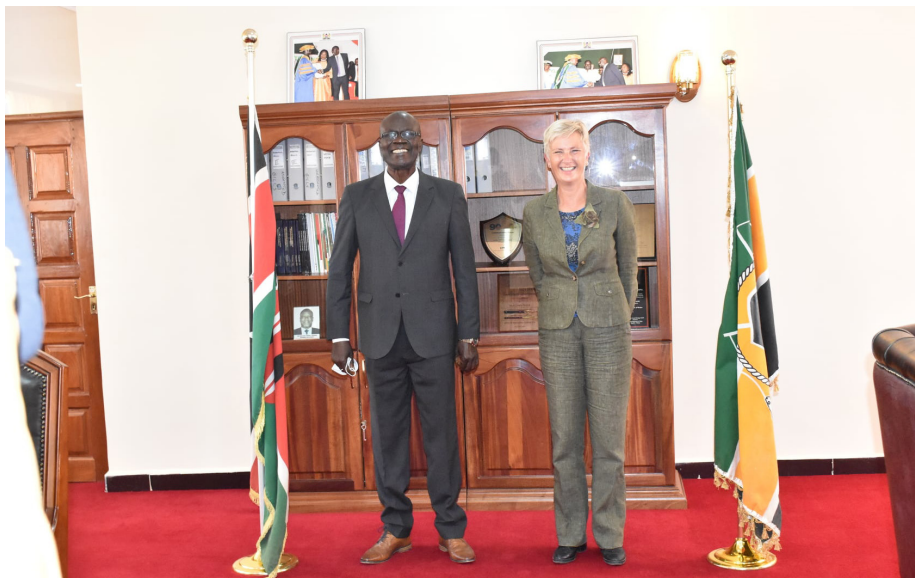
Siaya County Governor, Cornel Rasanga Amoth with H.E the Swedish Ambassador to Kenya Hon. Caroline Vicini at County headquarters

While on an evaluation tour yesterday to value chain actors, the Ambassador expressed her delight in view of women and youth inclusiveness in income generation ventures. She added that the Swedish Government is largely mainstreaming youth and women participation in all its programmes and Siaya County has greatly responded to the call with great impetus.