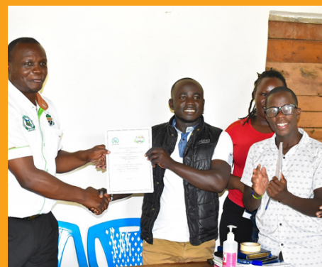
ASDSP II Siaya and Meaky Green Groceries and Farmers service Center (MGFSC) displays a signed working agreement

The partnership shall also include capacity building on other supporting value chains like cassava whose farm yields are raw materials to the highly valuable chicken feeds.