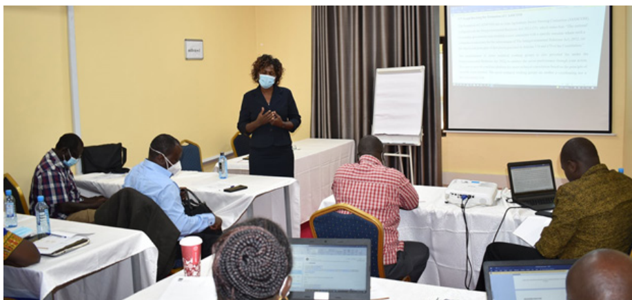
Department of Agriculture workshop at MillsView Hotel in Kisumu on County Agriculture Sector Steering Committee (CASSCOM) Strategic Plan 2021 – 2025 and Bill

Department of Agriculture, Food Security, Livestock and Fisheries, County Government of Siaya.