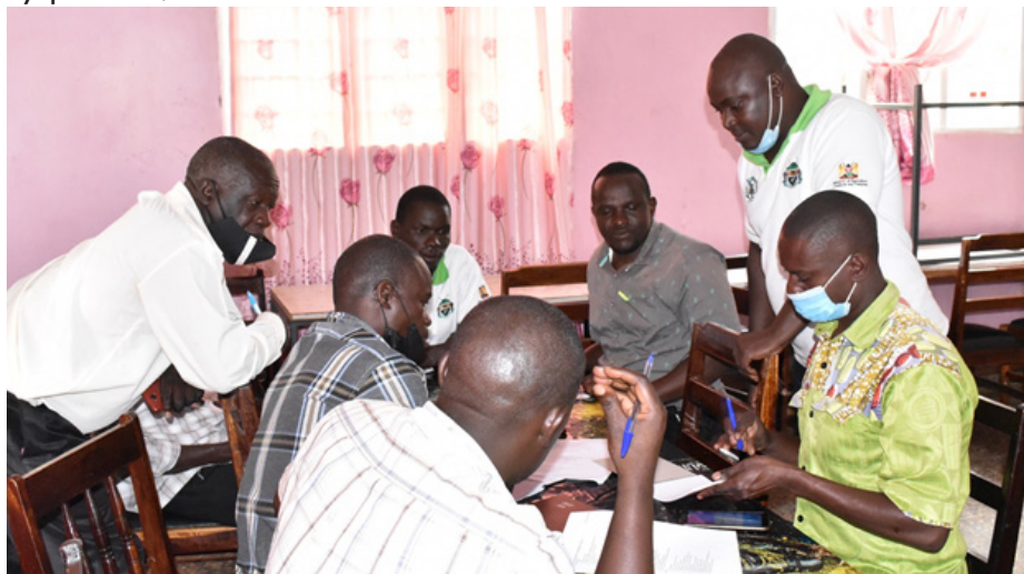
Service providers recapping on Mid term review findings on October 2021 at Kowiny resort

Other emphasis were on dissemination of ASDSP II programs, collaboration with development partners, stakeholders and agricultural sector programs and projects for sustainability of Value Chain Platforms and Value Chain organizations in Siaya County.