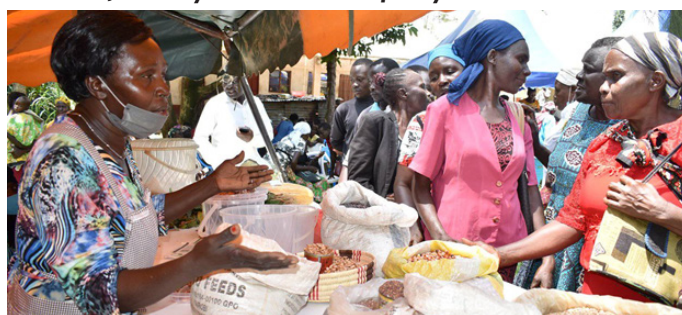
VCA displaying input used in feed formulation for fish and chicken as an innovation to improve quality of feed during a field day in Gem.

Department of Agriculture, Food Security, Livestock and Fisheries, County Government of Siaya.