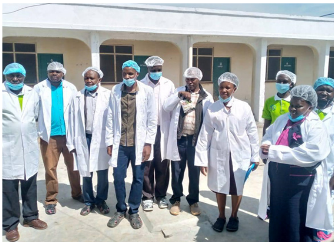
Machakos ASDSP II CPS visits char fresh at Lwanda Kotieno beach in siaya

A s part of an initiative to identify value chain development support and learning gaps, Agriculture Sector Development Support Programme Phase II (ASDSP II) Machakos County has recently visited Siaya, one of the top performers in the programme implementation.