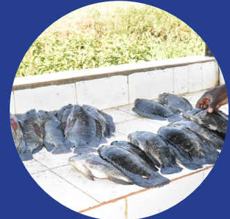
Fish Value Chain