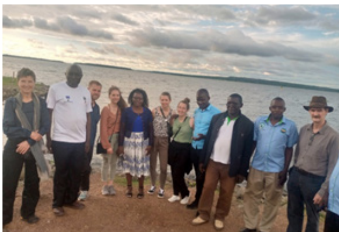
Team from JOOUST and Weihenstephan-Triesdorf University of Applied Sciences (HSWT) poses for a photo at the edge of the lake enjoying the cool offshore winds, and in the other photo the visitors are being shown fish cage fabrication site.

A griculture Sector Development Support Programme Phase II (ASDSP II) in collaboration with Jaramogi Oginga Odinga University of Science & Technology (JOOUST) has in the past week hosted Weihenstephan Triesdorf University of Applied Sciences from Germany that has a mandate to enhance incubation concept through Agribusiness hubs, students' entrepreneurial skills development through hands-on attachment/internship to host entrepreneurs and exchange programmes on sustainable region development.