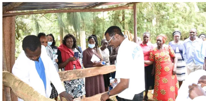
ASDSP Embu CPS inspecting a feed miller for Madeya Abedo Women Group in Gem Sub – County.