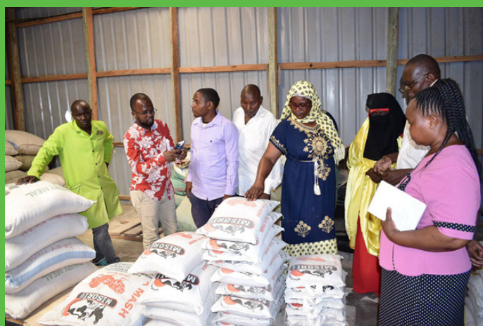
ASDSP II CPS and VCAs visit / Bench marking at MANINGI enterprises during exchange visit to Siaya.

Department of Agriculture, Food Security, Livestock & Fisheries, County Government of Siaya.