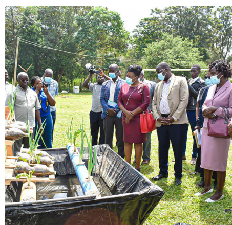
National Youth in Agribusiness Strategy domestication and launch in Siaya County at Siaya Institute of Technology.

Its launch yesterday at Siaya Institute of Technology comes at a time when over 124,000 out of a possible 340,000 youth are unemployed, 88% of them are living in rural areas and Agriculture is contributing 20 billion to the County GDP against an attainable 1.5 trillion.