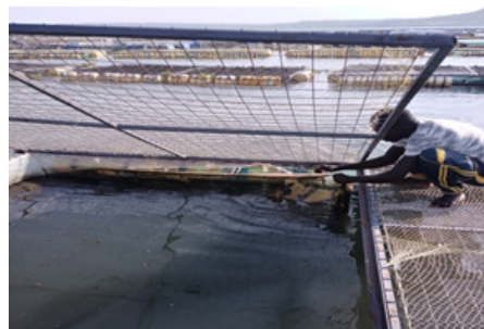
A rear gesture of fish cages in the lake and cage fabrication as an innovation

D ickens Otieno, the Secretary of Luanda Kotieno Cooperative society stares steadily at over 480 cages and points out at a fortune that has transformed the lives of fisher men, fish mongers, fabricators and several other individuals living around the beach.