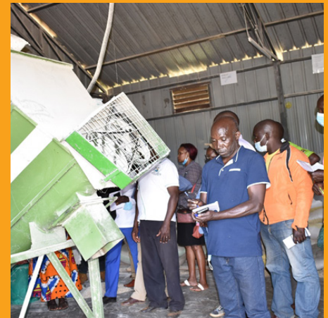
Vihiga CPS Visit at Bora feeds in Yala

S iaya County plays host to ASDSP II Vihiga County for purposes of gaining a different perspective of Indigenous chicken value chain development.