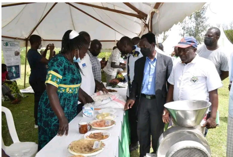
Mr. Bolo County Director of Fisheries visiting Exhibitors' stands during a Cassava field day in South Gem, Gem Sub – County

The County Government of Siaya in Partnership with Ugunja Community Resource Centre (UCRC) has today conducted a Cassava field day in South Gem, Gem Sub – County as a way of promoting the crop's adoption for increased food and incomes.