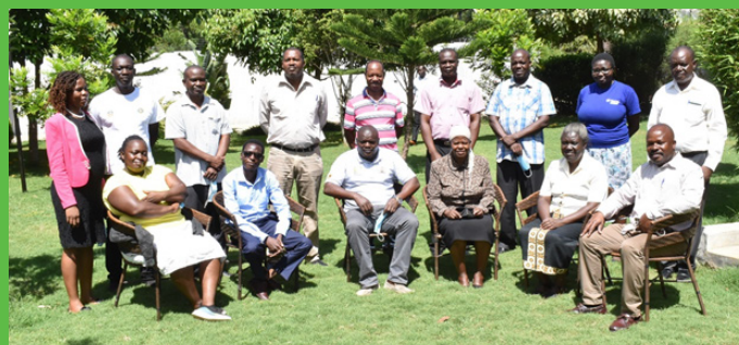
The County Department of Agriculture and APNI team after the day long deliberations on Food security mitigation measures

About 3,500 vulnerable farmers of Maize and beans are expected to benefit from a donor funded project through extension and quality seed support within the next nine months.