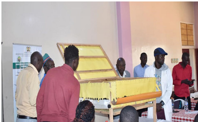
Innovative plastic Brooder made from locally available materials shown to incubator owners at Maningi Enterprises, Rarieda Sub – County.

S iaya Incubator Owners have been urged to strengthen their organizations and build communication within themselves in a bid to promote the local economy.