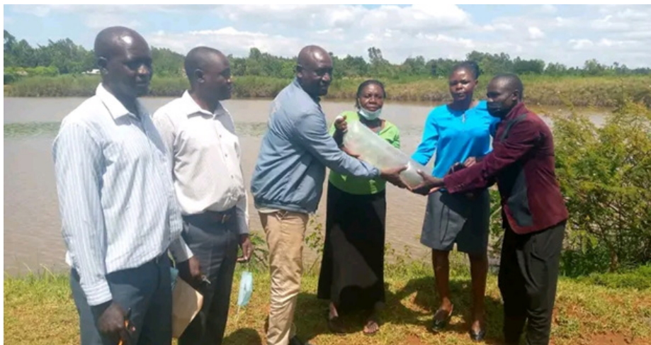
Fish VCAs supported with 200,000 fingerlings to boost fish production for enhanced food and nutritional security assisted by ASDSP II Service Provider.

T he County Government of Siaya through the Directorate of Fisheries recently distributed about 200,000 fingerlings across 6 dams, Yala Fish farm and Lwanda Kotieno Beach Management Unit in order to enhance production and restoration of fish stocks for improved income and diversified healthy diets in the County.