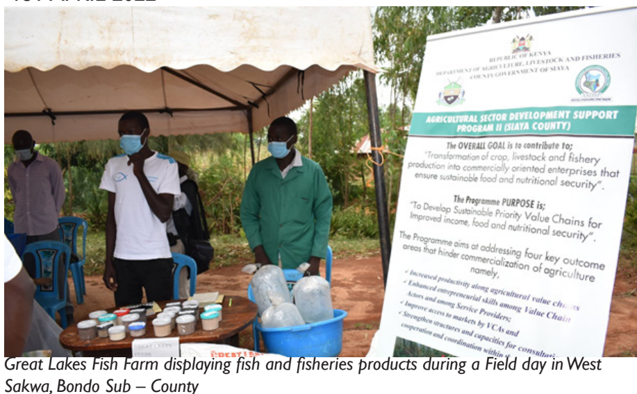
Great Lakes Fish Farm displaying fish and fisheries products during a field day in West Sakwa, Bondo Sub – County

In adherence to Covid 19 regulation protocols, Farmers in West Sakwa Ward, Bondo Sub – County were yesterday hosted at Tuzzler Progressive Farm on a field day aimed at inculcating the spirit of embracing climate smart Agriculture for increased productivity and improved livelihoods.