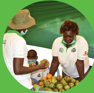
Mango Value Chain