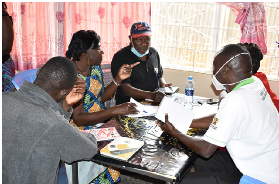
A group discussion during the service providers sustainability meeting at Kowiny resort

T hirty two Service providers within the Agriculture Sector Development Support Programme Phase II (ASDSP II) have been urged to operate with least dependence on the programme or any other external programmes if they are to ensure sustainability of their Value Chain Actors (VCAs).