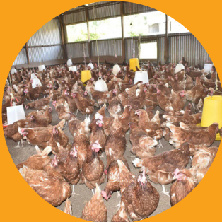
Indigenous Chicken Value Chain

Department of Agriculture, Food Security, Livestock and Fisheries, County Government of Siaya