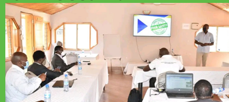
Institutionalization workshop for food safety operations by County Government of Siaya in collaboration with ASDSP II Siaya

In a bid to institutionalize food safety operations, the County Government of Siaya in collaboration with Micro Enterprises Support Trust (MESPT) through the Green Employment in Agriculture Programme (GEAP) has today established a County Food Safety Committee.