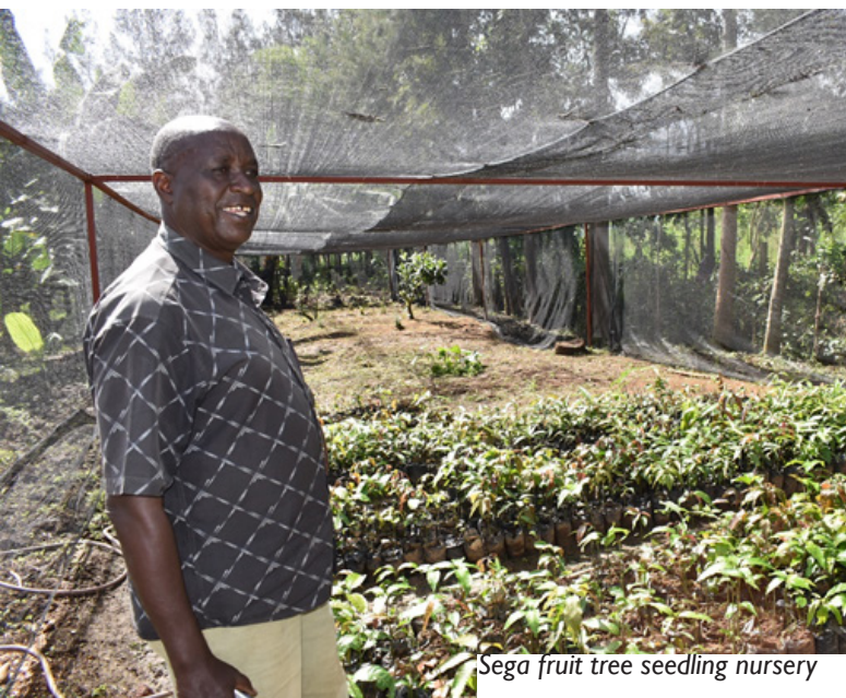
Sega fruit tree seedling nursery

T here is a perception among a majority of citizens that riches doesn't come through formal employment but rather through self-businesses.