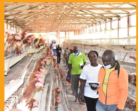
Vihiga CPS Visit at Obwombe Chicken Farm

The visit certainly availed a new standardized set of processes and metrics such as identification and capacity building of lead actors to act as role models to the upcoming.