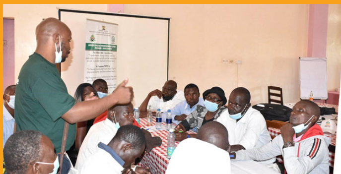
ASDSP II Value chain actors being sharpened by Retail Pay's Cultivate Platform as a way of stabilizing Agribusiness Development and Trade facilitation through Digitization/E-marketing

Over 50 Fish and Mango Value chain actor representatives supported by Agriculture Sector Development Support Programme Phase II (ASDSP II) were yesterday sharpened on Retail Pay's Cultivate Platform as a way of stabilizing Agribusiness Development and Trade facilitation through Digitization.