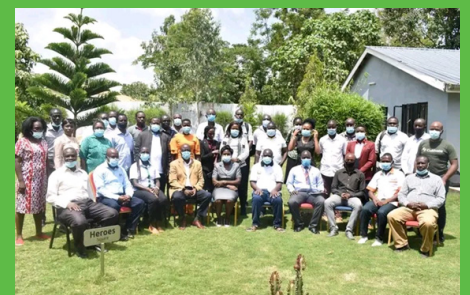
County Agriculture Sector Steering Committee (CASSCOM) meeting at Distinction Gardens 2021

The ASDSP II Coordinator in his response thanked the team and gave an assurance that well-coordinated intervention strategies shall be set to ensure value chain actors benefit from the program.