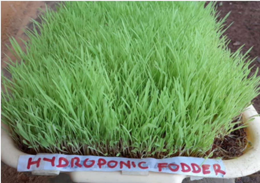
Hydroponic as used in supplementing chicken feed

M eaky Green Groceries and Farmers service Centre (MGFSC) in collaboration with ASDSP II Siaya yesterday conducted a training on hydroponics farming to about 100 Poultry producers within Ugunja and Ugenya sub counties to help bridge the gap on high feed prices.