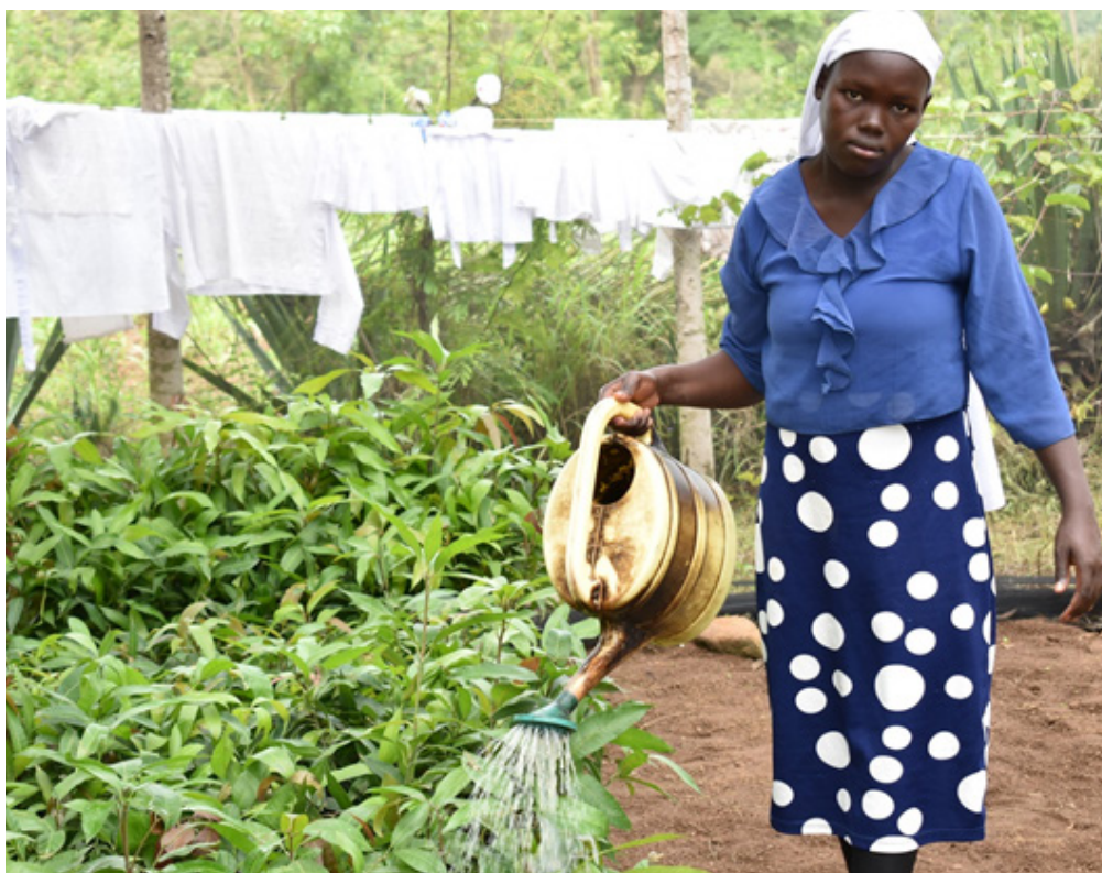
Omia Mualo fruit tree seedling nursery under innovation shade net

She says that the support has come in handy with intervention-oriented training on certification and Proper